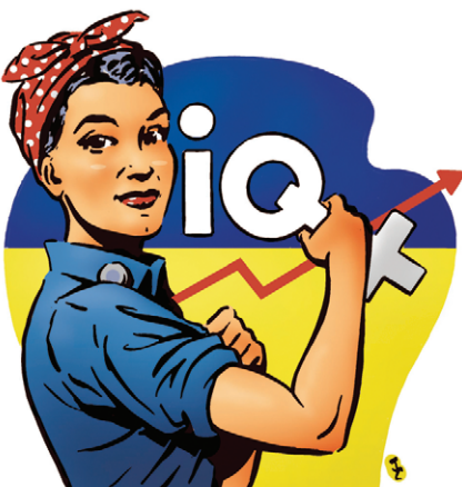
ILLUSTRATION: JONATHAN CARLSON

Many factors you might think would be predictive of group performance were not. Group intelligence had little to do with individual intelligence.